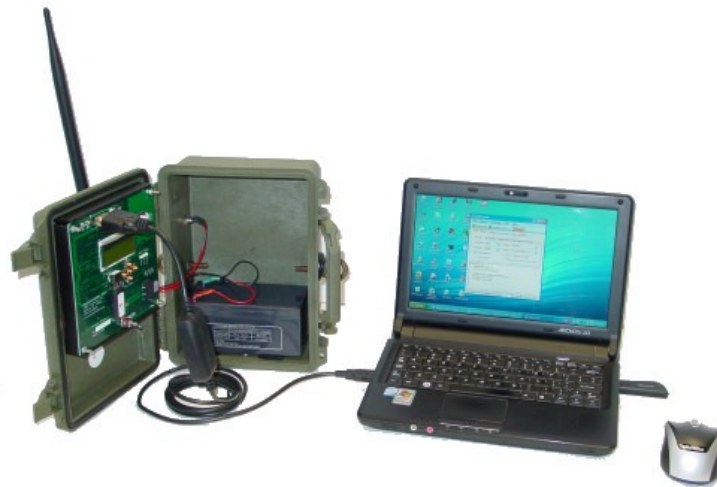
Connect the Serial to USB Cable to your PC

4. Run the ds30 Loader software and load the .HEX file as shown below. Press the “Download” button to install the Firmware on the Raptor system. The MCU Stat LED will start blinking when the download starts. Do not power down the Raptor system or unplug the cable until the firmware update is complete.